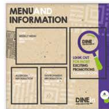
MENU BOARD - Displaying Menus, Posters, and Dietary Information

We have shown a few sample items from this range, (RIGHT) but can provide a full list upon request.