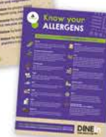
POSTERS and FLYERS - Did You Know Posters, Environmental Flyer and Allergen Information