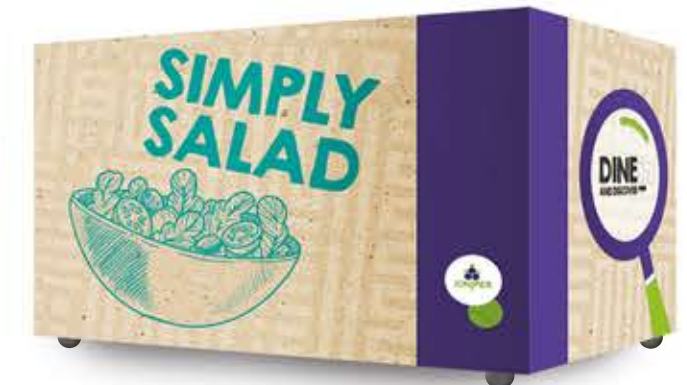
TROLLEYS and WASTE STATIONS - A variety of trolleys including chilled Salad trolleys, Hot trolleys and Clearing/Waste Stations