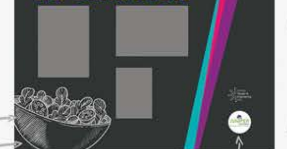
The brand logos